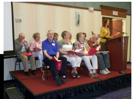
Tremble Clefs Choir