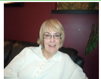
Certified Clinical Counselor

Healing Touch Practitioner Integrative Imagery Specialist